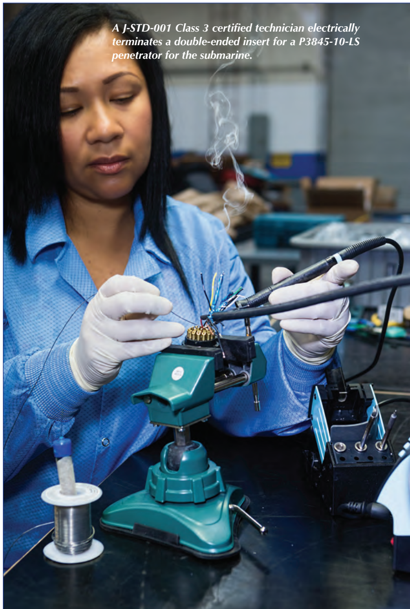
A J-STD-001 Class 3 certified technician electrically terminates a double-ended insert for a P3845-10-LS penetrator for the submarine.

DeepSea Submarine Technologies Inc. (Saipan, Northern Mariana Islands) recently contacted BIRNS Inc. (Oxnard, California) to develop 18 ABS-certified custom penetrators and cable assemblies for its 68-foot, 300-FSW-rated manned tourist submarine, Deepstar. The DS-48 class, 68-foot long, ABS-ASME-certified sub is capable of carrying up to 48 passengers on a coastal route in Saipan Lagoon, Northern Mariana Islands, usually with dive durations of 60 minutes. DeepSea Submarine Technologies needed to retrofit the 15-year-old sub to replace its thruster and control cables with BIRNS P3845 straight penetrators (P38 penetrator size, 45-millimeter thread length), in both four (P3845-4-LS) and 10 (P3845-10-LS) conductor configurations. The penetrators were highly customized to include special marine-grade cable stock of various lengths, as well as electrical shielding and special termination. The P38 shell mounting threads were unified thread standard (UTS) UNF-2A; 1.5 to 12 with a 12-threads-per-inch