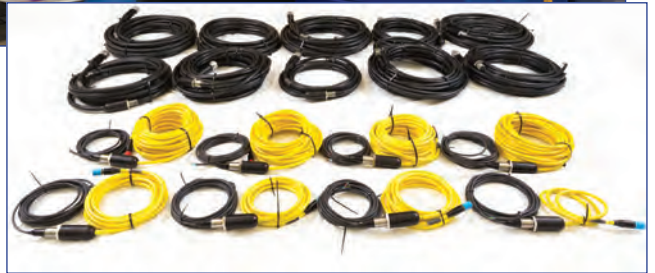
(Top) After the polyurethane overmolding process, a penetrator is removed from its aluminum mold and ready for testing. (Middle) A six-cycle saltwater hydrostatic pressure test is performed, with the outboard side of the penetrator held to pressure of 1,000 psi. (Bottom) Final custom penetrator cable assemblies for the 68-foot Deepstar.

(TPI) and a 1.5-in. male thread outside diameter. The submarine had a pressure hull thickness penetrator plate of 0.98 inches and a maximum pressure of 108.75 psi (7.5 bar).